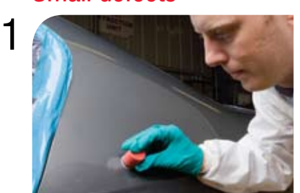
Remove defect using 3M<sup>™</sup> 9 Micron Abrasive Discs 268L (00127).